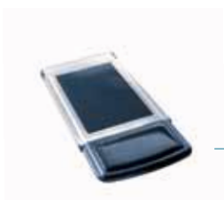
Add a PC card for the greater portability of wireless LAN connectivity.