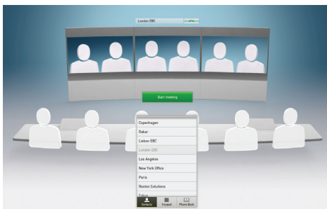
Intuitive User Interface

Total Service — Service choice for the control you want with the security you need. As a single source for all telepresence needs, TANDBERG's full portfolio of services support customers every step of the way, from installation and deployment right through to concierge level services and support. With 24/7/365 availability and guaranteed service agreements, Total Service translates into total peace of mind.