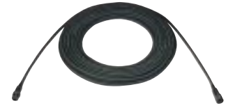
RK-1713 Connecting Cable