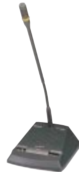
SX-D100A Delegate's Unit